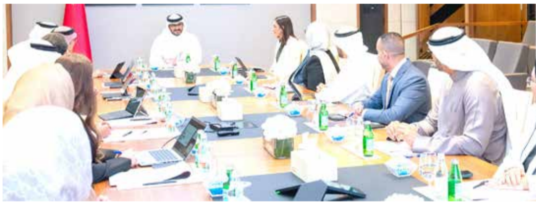
Board meeting in progress

Amidst discussions on Tamkeen's strategic objectives