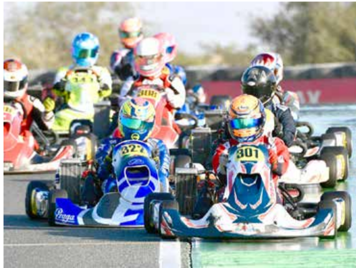
Wheel-to-wheel action from the season's final weekend

Bahrain International Circuit (BIC), "The Home of Motorsport in the Middle East", crowned over the weekend the 2023/2024 champions of the Bahrain Rotax MAX Challenge (BRMC)—the Kingdom's premier annual karting championship.