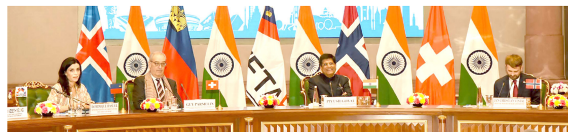
Piyush Goyal (2R), India's Minister of Commerce and Industry, Consumer Affairs, Textiles, Food and Public Distribution addressing diplomats at the signing ceremony

India and the four-member European trade bloc EFTA, including Norway and Switzerland, signed a $100-billion free trade agreement yesterday to promote investment and exports... The deal was signed after several rounds of negotiations spanning 16 years