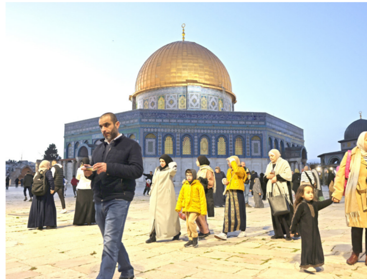
People walk past the Dome of the Rock at the compound of the Al-Aqsa mosque ahead of the start of Islamic holy fasting month of Ramadan, in the Old City of Jerusalem

Ramadan will begin today, Saudi Arabia, Qatar and the UAE announced, with the holy fasting month taking place against a backdrop of devastating war in Gaza