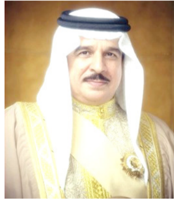
HM the King

HM King Hamad and HRH Prince Salman received cables of congratulations on the blessed