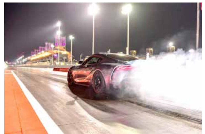
Action from a previous event at BIC

Both the drag racing and the drifting can be done for a single fee of BD11. Participation in just the drag racing or just the drifting costs BD8. Those who would like to experience the drag or drift as a passenger can get into a participant's car for an additional fee of BD4.500.