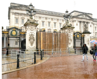
People walk past the set of boarded up gates to Buckingham Palace in London

Officers arrested a man who crashed a car into the gates of London's Buckingham Palace over the weekend, police said yesterday... The Metropolitan Police said the car 'collided with the gates' of the royal residence at 02:30 GMT on Saturday