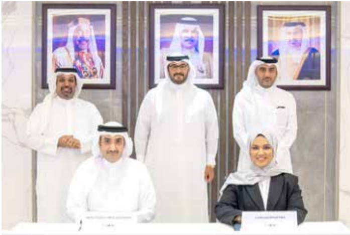
The deal signing

The signing was in the presence of Shaikh Isa bin Salman bin Hamad Al Khalifa, Chairman of Tamkeen and Salman bin Khalifa Al Khalifa, Minister of Finance and National Economy