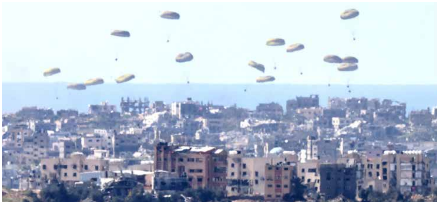
Humanitarian aid being airdropped over the Gaza Strip amid the ongoing conflict.

With the UN repeatedly warning of famine, the US, Jordanian and other planes again airdropped food aid, but the United Nations aid coordinator for the area has said more supply by