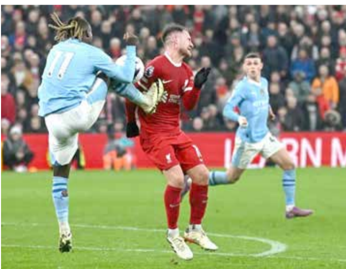
Manchester City's Belgian midfielder #11 Jeremy Doku (L) kicks Liverpool's Argentinian midfielder #10 Alexis Mac Allister

The final Premier League clash between Jurgen Klopp and Pep Guardiola did not dis-