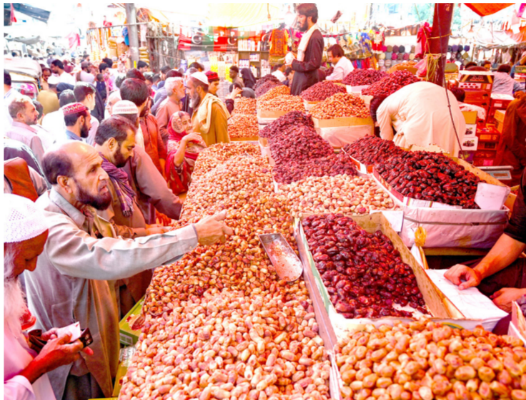
People buy dates at market ahead of the holy fasting month of Ramadan in Karachi

Ramadan will begin today, Saudi Arabia, Qatar and the UAE announced, with the holy fasting month taking place against a backdrop of devastating war in Gaza