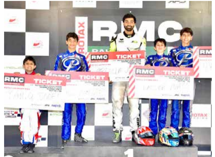
The new champions with their tickets to the Rotax MAX Challenge Grand Finals