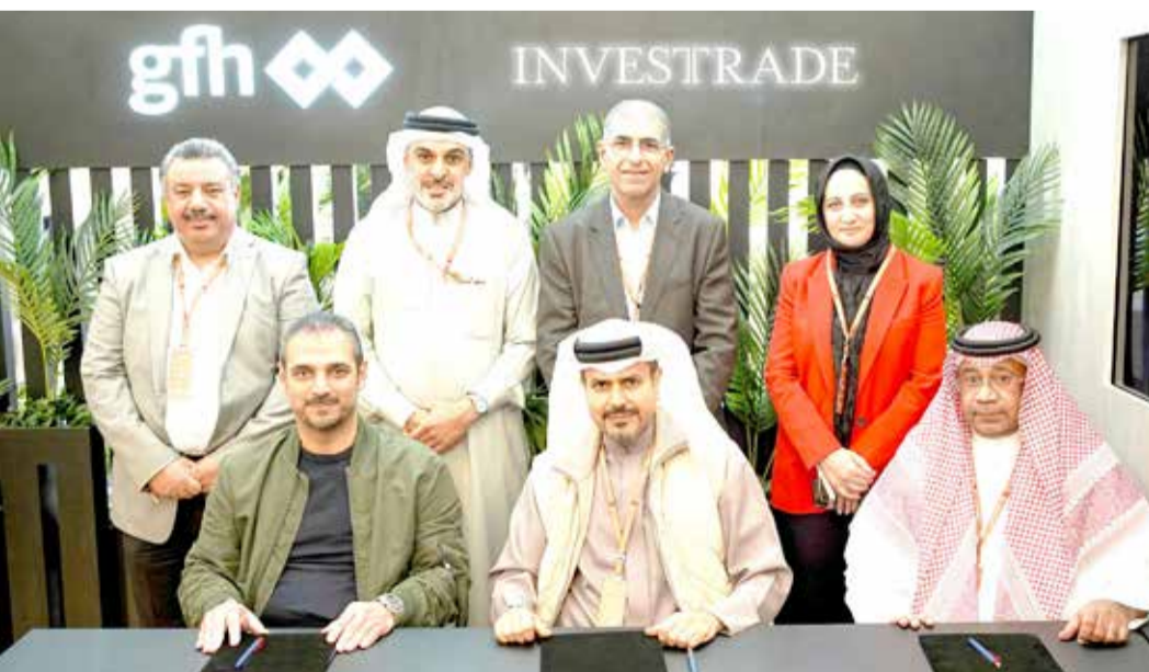
The deal signing

The Areen Park Hotel and The Land of Paradise Waterpark project include a luxury hotel belonging to Al Areen Hospitality, in addition to a group of villas and apartments. The project will provide a new city on a total area of 2 million square metres, accommodating approximately 25,000 people. It is strategically located near the King Fahd Causeway, Exhibition World