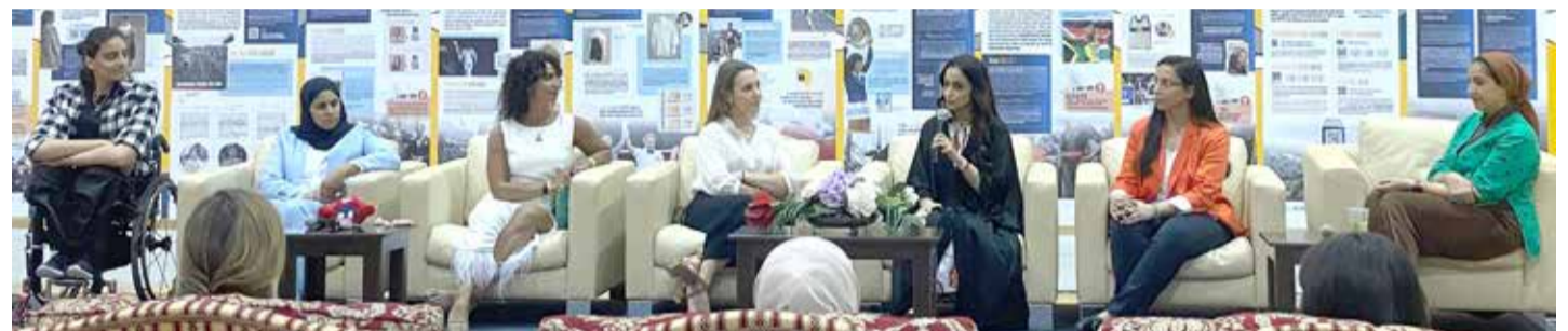
Participants taking part in a panel discussion

She acknowledged the limited opportunities for women in football and recounted how she established Bahrain's first women's national football team to create more avenues for female