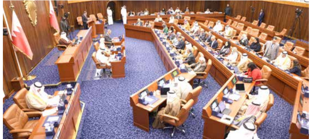
Shura Council Chairman Ali bin Saleh Al Saleh presides over the session

While BD12 per square metre was being collected earlier, with